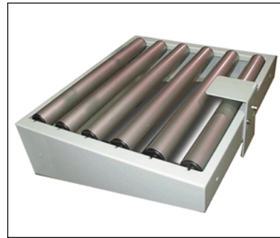
Infeed/Exit Conveyor w/ Stabilizer