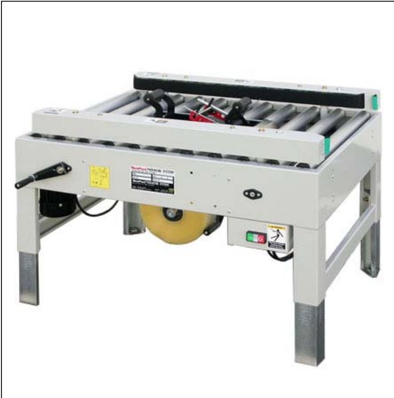
MSD22 Manual Side Drive

The BestPack® MS20 Semi-Automatic Uniform Carton Sealer is our most popular top of the line operator-fed and adjustable carton sealing machine, designed to cater to the needs of light-to-heavy duty uniform bottom carton closure applications.